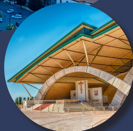
San Giovanni Rotondo